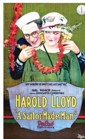
St. Bartholomew's Church, Deviant Septet, Harold Lloyd movie poster

St. Bartholomew's Church, the historic Episcopal parish on Park Avenue in New York City, this fall celebrates the 100th anniversary of the first service in its current location. The magnificent 1918 Romanesque-style church features a portal designed by Stanford White and a grand Byzantine-style interior – and two of New York’s unlikely but outstanding concert spaces: the